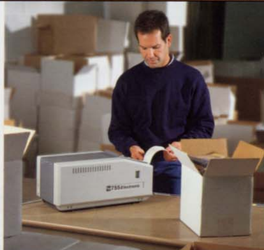
BP755e Electronic Tape Dispenser

Rugged and easy to operate describe the BP755e. This state-of-the-art electronic tape dispenser offers the operator 20 preset choices from 6" to 75" – with the push of a button.